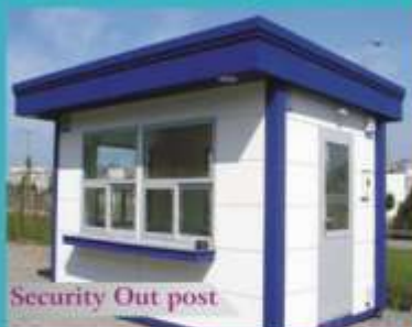
Security Out post